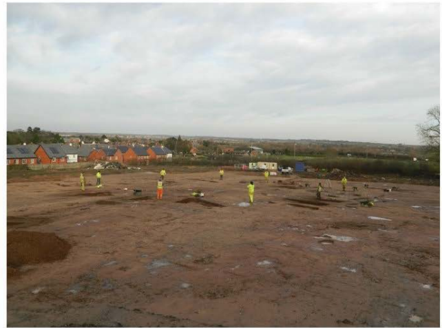
Plan and view of the Rothley excavations

At Waltham on the Wolds Trial trenching revealed evidence for Roman activity of the 1st century AD. Three trenches contained several gullies and pits and there was evidence of small-scale iron working. Environmental remains suggest crop processing and consumption in the vicinity. The archaeological features may indicate a small Roman rural settlement or farmstead.